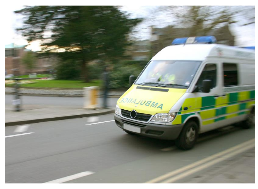
Figure 4: Uncontrolled e-scooter sharing schemes have resulted in many injuries in the US. As legislation is changing, a similar situation could emerge in the UK if escooters are not properly integrated into the urban transport infrastructure.

between 2007 and March 2018, 400 cyclists were killed or seriously injured in the UK due to poorly maintained roads. Such safety issues need to be considered as legislation begins to change in the UK.