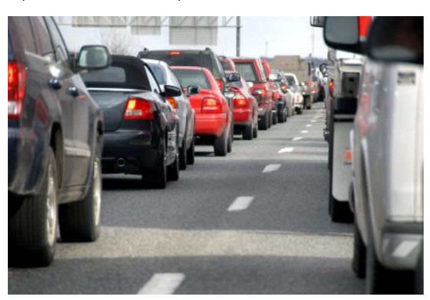
Figure 3: E-scooters could help us to tackle congested UK cities.

Motor vehicles, particularly cars, are incredibly popular in cities. With 74% of adults possessing a driving licence, and 87% of UK motorists agreeing that their current lifestyle requires a car,<sup>19</sup> congestion is becoming a huge problem. As well as the serious environmental impact congestion is having, there is also an impact on the economy - the time lost due to congestion costs the UK economy approximately £2 billion every year.<sup>20</sup> The 2017 British Social Attitudes Survey found that 56% of respondents perceived congestion in towns and cities to be a serious or very serious problem.21 The use of micromobility