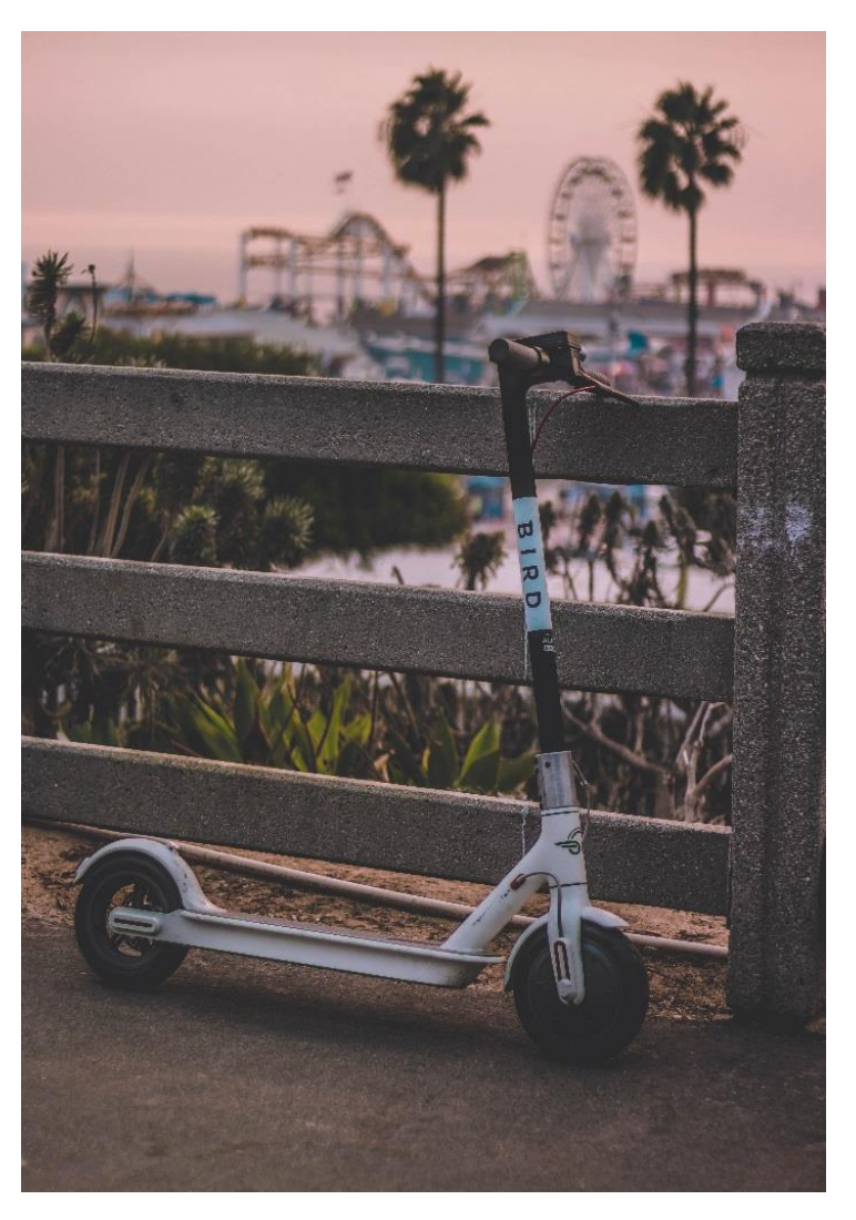
Figure 2: An electric scooter (e-scooter).

A few days before rental e-scooters became legal on GB roads, the government released the <u>E-scooter trials: guidance for local areas and rental operators</u> guidelines.<sup>7</sup> These guidelines outline the fact that the e-scooter trials are intended to run for 12 months, with the possibility of an extension being built into the legislation. Also detailed are the changes to legislation that are required to introduce rental e-scooter trials, including the fact that rental e-scooters are to be treated very similarly to electrically assisted pedal cycles (EAPCs), however they will still be categorised as motor vehicles. Key points from the guidelines are as follows:<sup>7</sup>